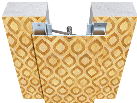
Straight Application DMS