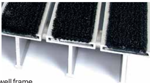
mat-well frame. Color Options: